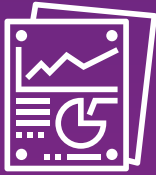
Maturity Gap Report