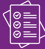
Executive Summary & Cyber Strategy