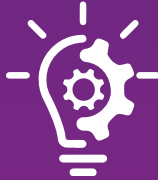
Risk Scenario Assessment Report